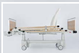
Backrest adjustment : 0 - 68°