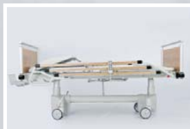
Foot rest mechanical adjustment : 0 - 22°