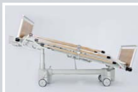
Trendelenburg position : 0 - 14°