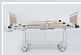
Mattress platform maximum height : 83 cm (150 mm with castor)