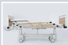
Thigh rest adjustment : 0 - 27°