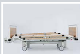
Mattress platform minimum height : 46 cm (150 mm with castor)