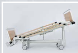
Anti - trendelenburg position : 0 - 14°