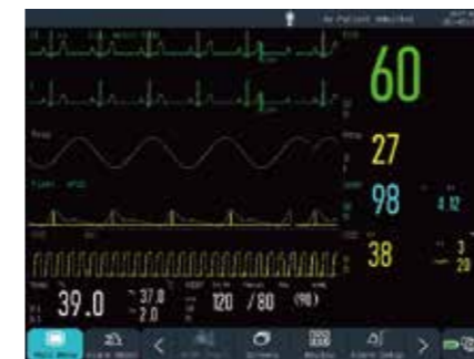
EtCO 2 Display

The new generation of Comen's semi-modular monitors offers the most commonly used parameters, including ECG, NIBP, SpO 2 , RESP, TEMP and dual IBP. With its modular design, it is able to be equipped with modules based on clinical needs. Alternative usage of the modules makes the clinical work more convenient and efficient.