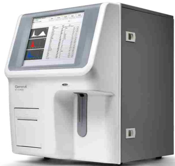
KT-6400 Auto Hematology Analyzer