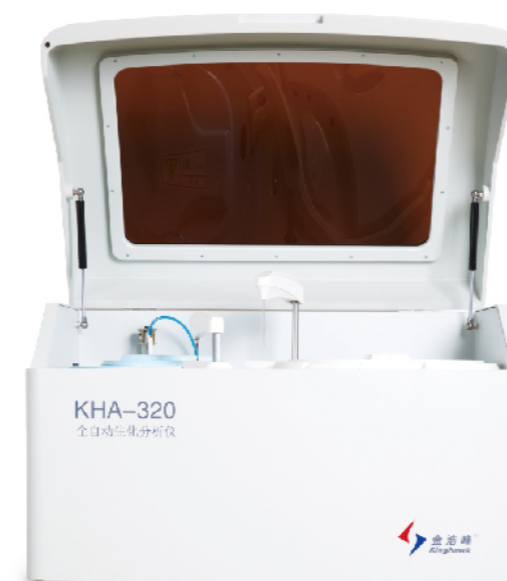
Bench-top available, compact size