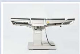
Tilt right : 18°