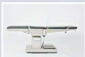
Minimum height : 71 cm