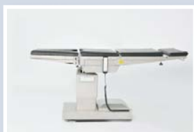
Longitudinal slide of tabletop : 15 cm