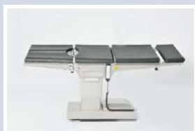
Tilt left : 18°