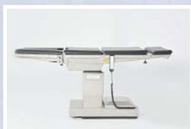
Longitudinal slide of tabletop : 15 cm