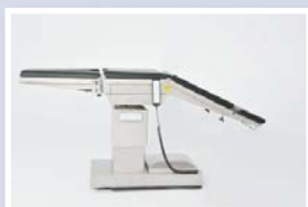
Back plate down : 0 - 22°