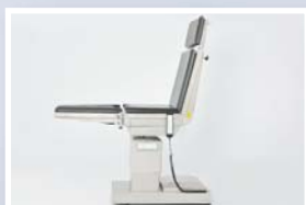
Back plate up : 0 - 75°