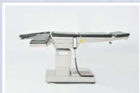
Leg plate horizontal extension : 90°