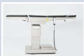
Maximum height : 111 cm