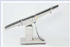
Anti - trendelenburg position : 0 - 18°