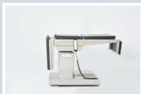
Leg plate up / down : 10° / 90° Head plate up/down: 50° /90°