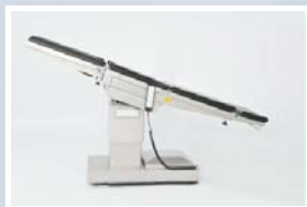
Trendelenburg position : 0 - 18°