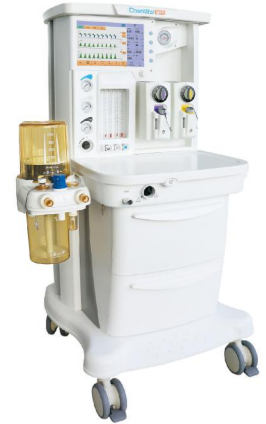
CWM-302 Anesthesia system