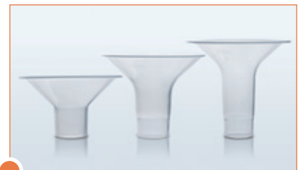
Funnel 21 / 24 / 27mm