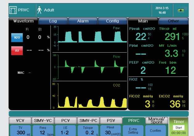
Advanced ventilation mode