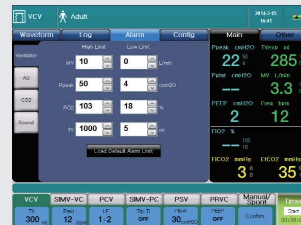
Alarm setting interface